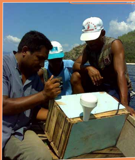
Consulting the fish finder in Timor-Leste

Where RFLP has introduced GPS navigation devices or fish finders they have been very warmly embraced by fishers who realize the immediate benefits of finding more fish, more easily, more cheaply. In Sri Lanka, those catching cuttlefish were able to reduce fuel costs considerably while in Timor-Leste catches by some using RFLP-supplied fish finders have increased so much that they have been able to purchase their own unit. The clear benefits of this equipment and the increasing affordability are likely to lead to rapid adoption by more and more small-scale fishers – without management measures in place this may cause problems. RFLP is working with the National Directorate of Fisheries and Aquaculture in Timor-Leste on policies to limit fishing effort of boats equipped with fish finders.