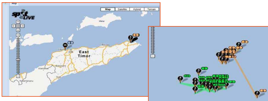
Data from SPOT units can be tracked online in close to real time.