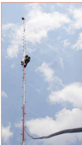
The radio repeater in Toeuk Chhou District of Cambodia's Kampot Province

A radio repeater receives a weak or low-level signal and retransmits it so that the signal can cover longer distances.