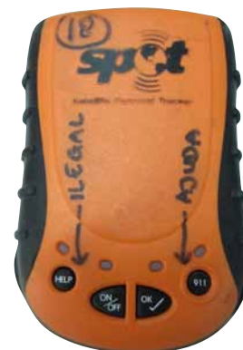
A SPOT tracker unit used by RFLP in Timor-Leste

SPOT units were used by RFLP as part of a community Illegal, unreported and unregulated (IUU) reporting and safety-at-sea pilot in Timor-Leste. If fishers saw IUU they would push one button and if they were in an emergency situation they would push another button. Pushing the button would immediately mark the position of IUU that could be viewed on an online map. Meanwhile, the rescue button would deliver an instant message to an emergency focal point.