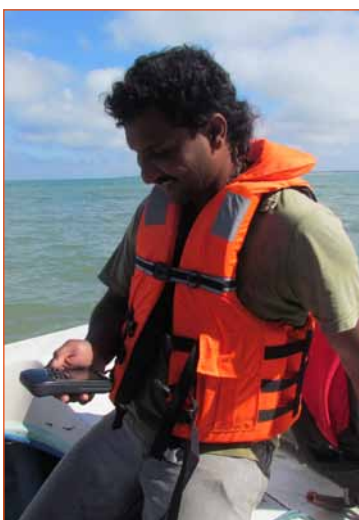
A Sri Lankan fisher consults his GPS

A GPS navigation device is any device that receives Global Positioning System (GPS) satellite signals to determine its location.