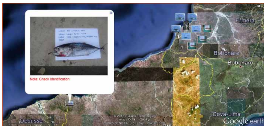
Fish price and name data displayed online